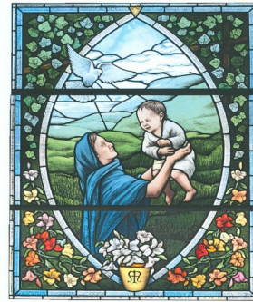
St. Henry Church - Daily Mass Chapel Nashville, Tennessee Dedicated January, 2011

"The Life of Christ and the Christian Vocation, Meditations in Stained Glass" is available at the information center near the Chapel. It is a meditation piece to accompany our four beautiful chapel stained glass windows.